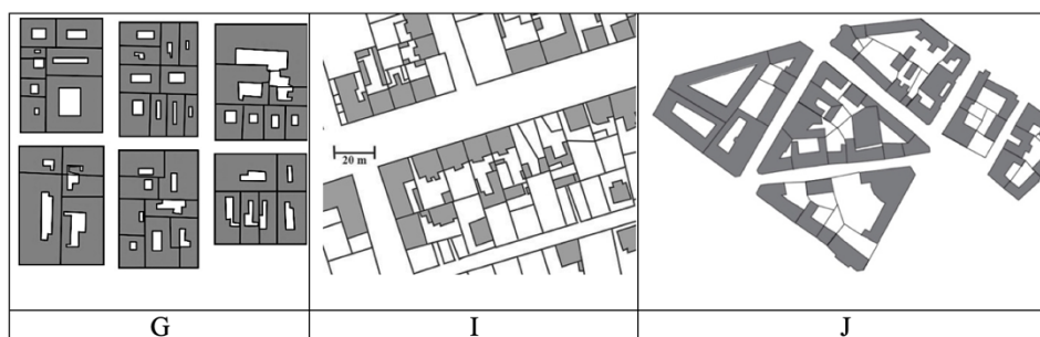
Figure 2. “G”-“I”-“J” urban tissue types

In case of the “Jg” 3 -“Jh” 4 urban tissue types, similar rules could be accepted, although in these cases, the urban green spaces are more spacious. The two urban tissue types are not similar to their urban form features, but the same principles could be used in case of potential development.