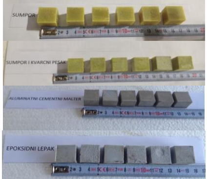
Figure 1. Samples for testing compressive strength of the material for surface leveling

Samples for testing compressive strength of the material for surface leveling is shown in Figure 1.