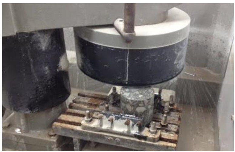
Figure 2. Preparation of the ends of the samples by grinding

The way of preparing ends of the samples by grinding is shown in Figure 2.